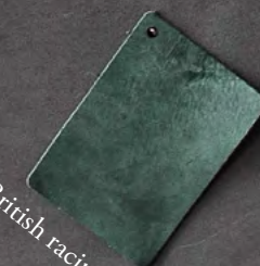
British racing green