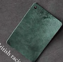
British racing green