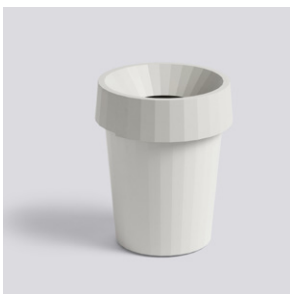
OFF WHITE / 507823