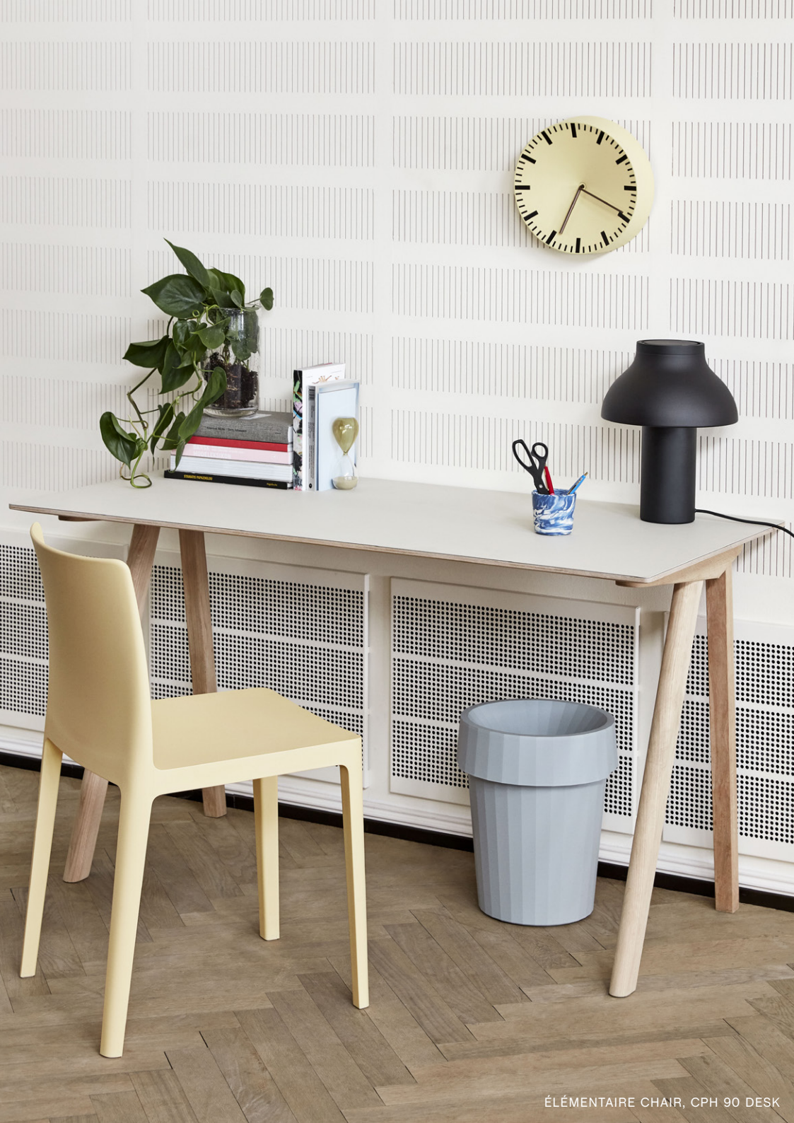
ÉLÉMENTAIRE CHAIR, CPH 90 DESK