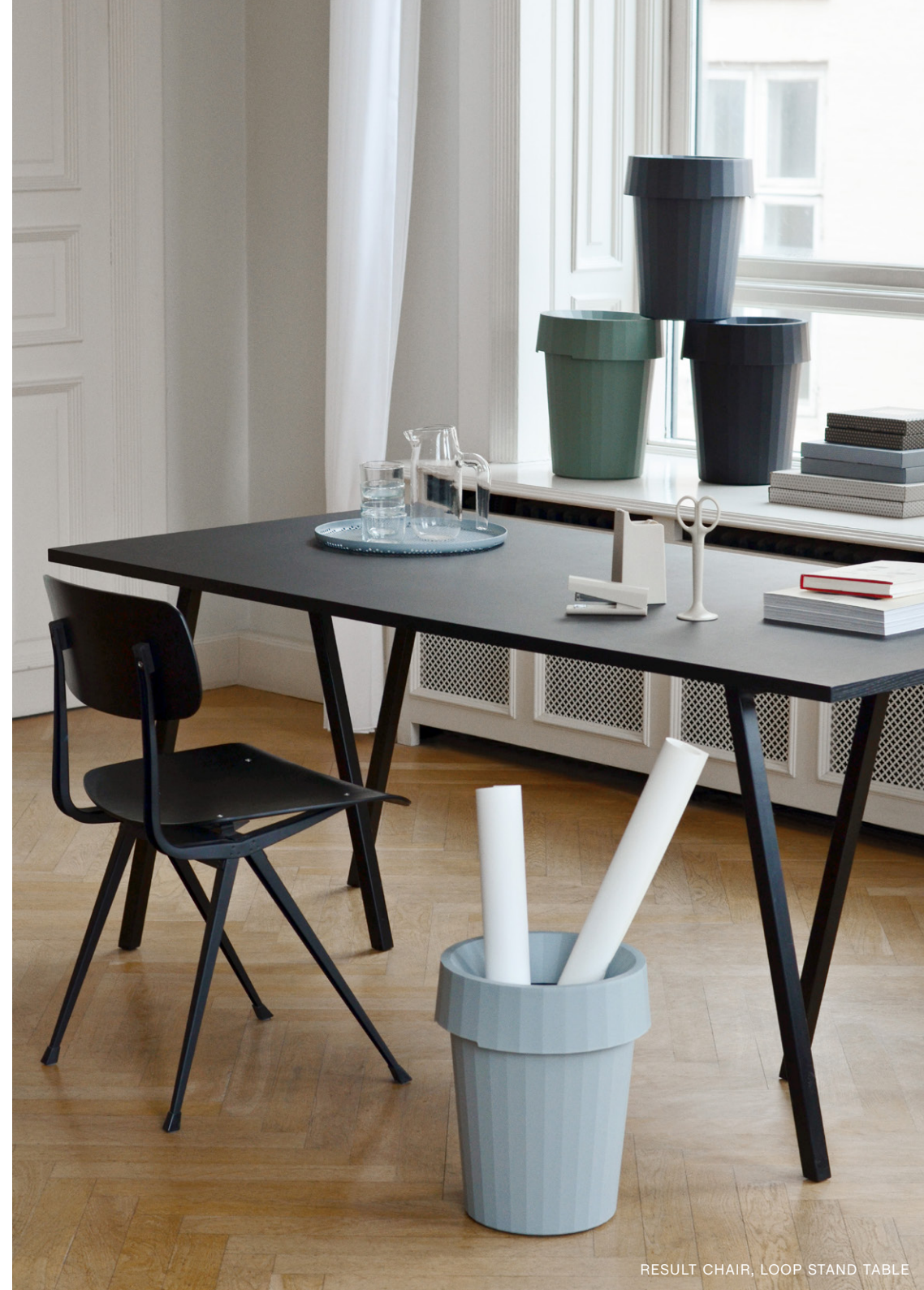
RESULT CHAIR, LOOP STAND TABLE