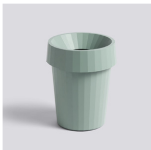
DUSTY GREEN / 507824