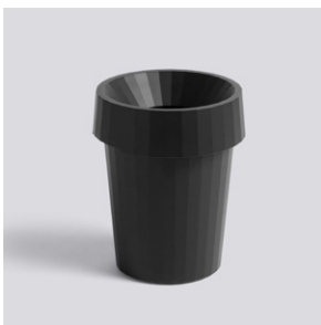
CHARCOAL / 507826