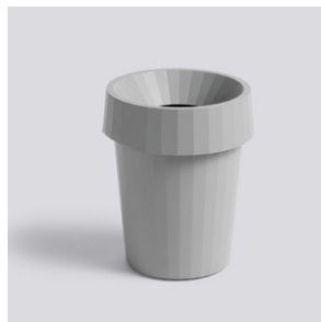
GREY / 507821