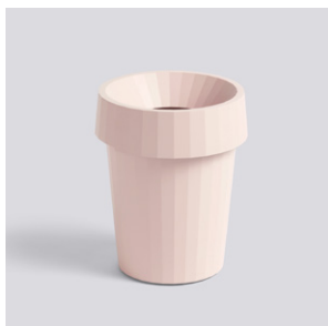
BLUSH / 507822