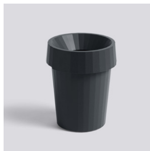
BLACK / 507828