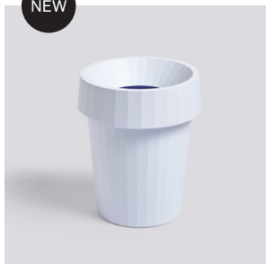
LAVENDER / 507829