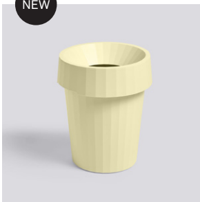
SOFT YELLOW / 507830