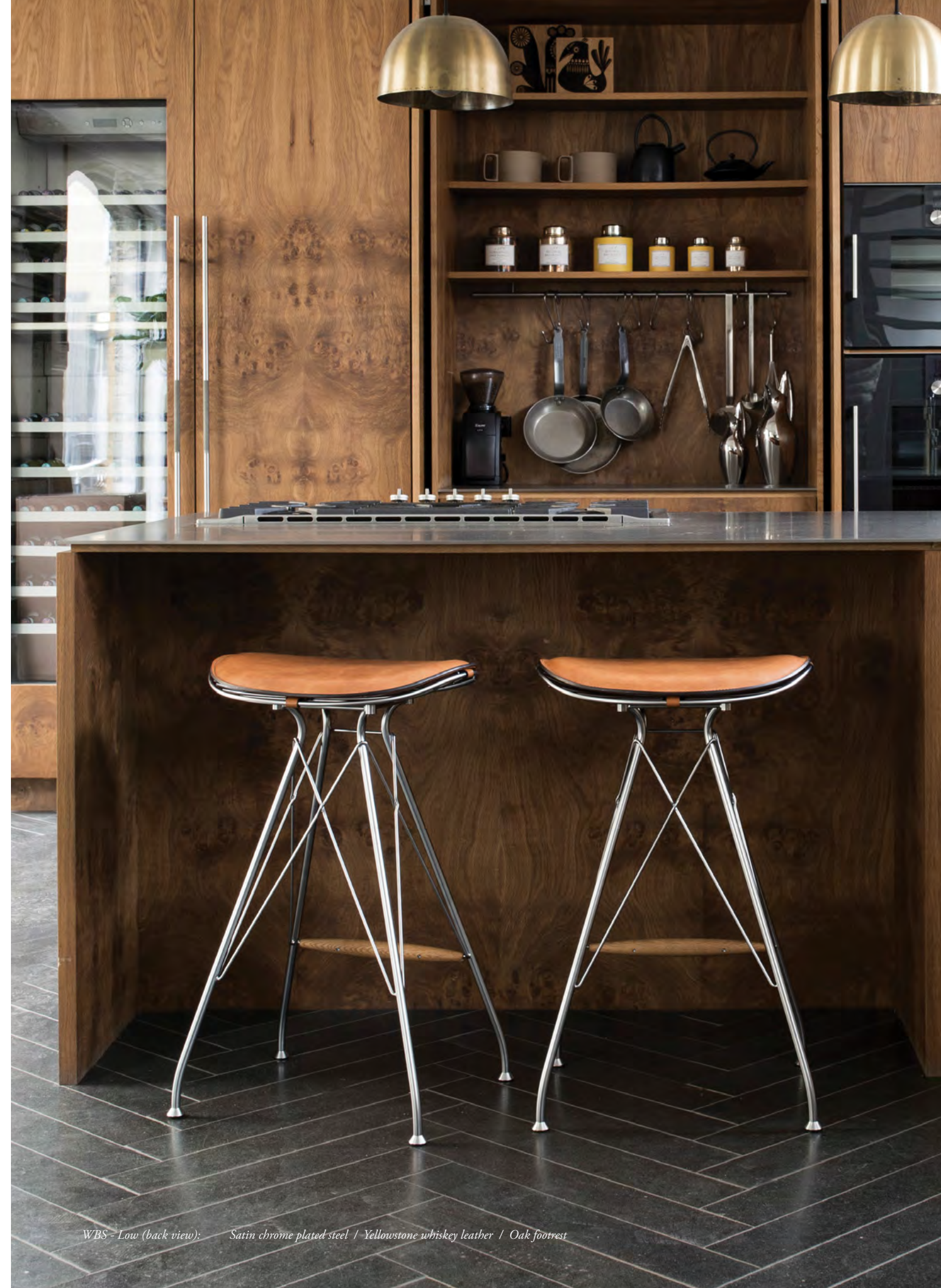
WBS - Low (back view): Satin chrome plated steel / Yellowstone whiskey leather / Oak footrest