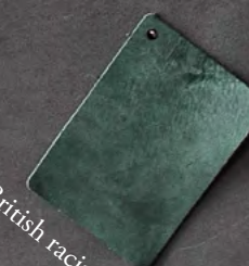
British racing green