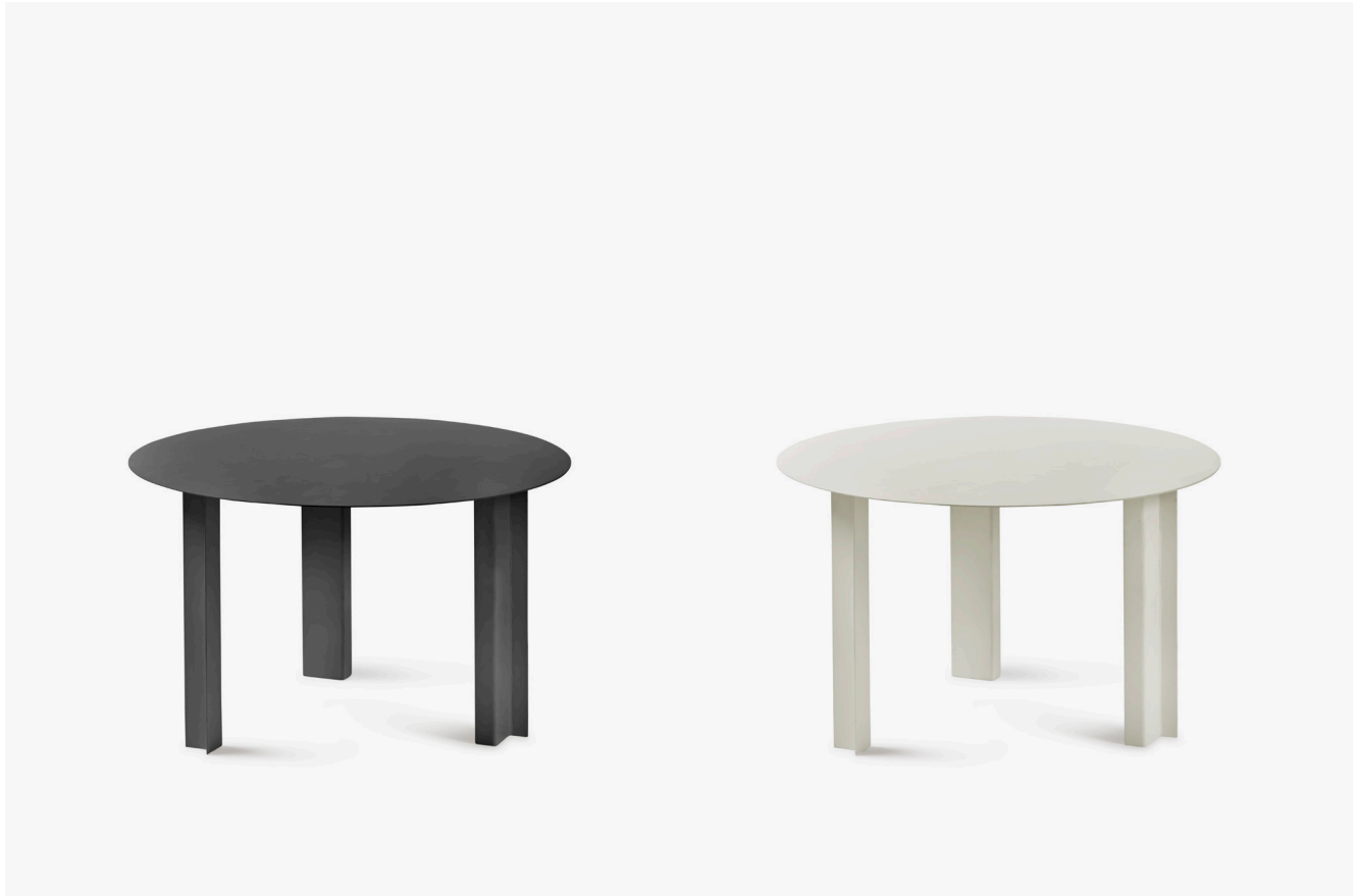
SIDE TABLE M BLACK: 319 EURO