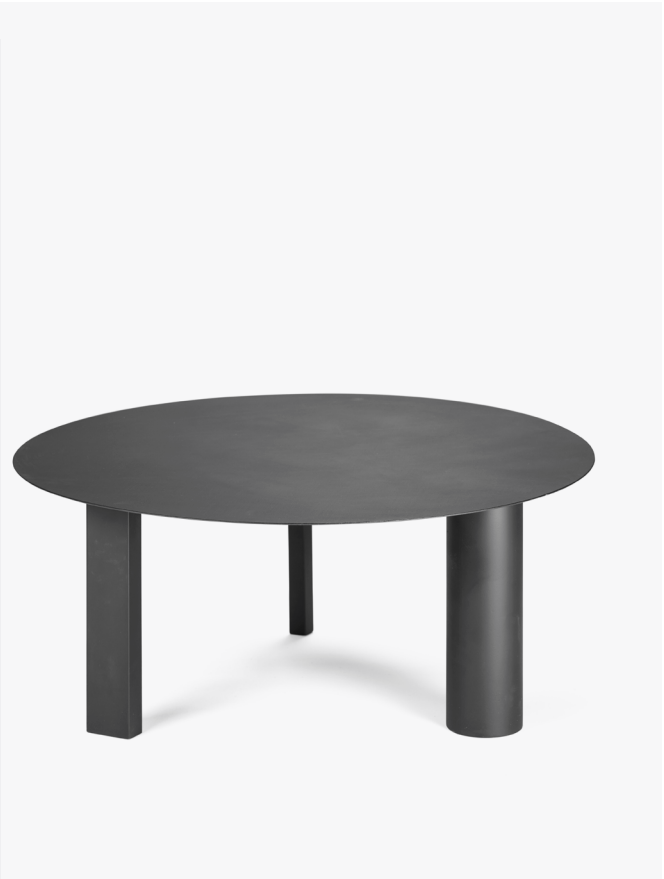
SIDE TABLE L BLACK: 439 EURO