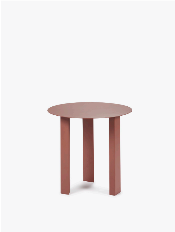
SIDE TABLE S RED: 259 EURO