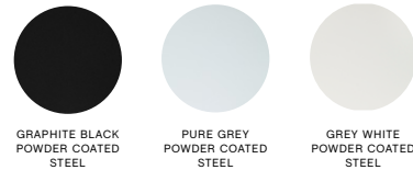
GRAPHITE BLACK POWDER COATED STEEL